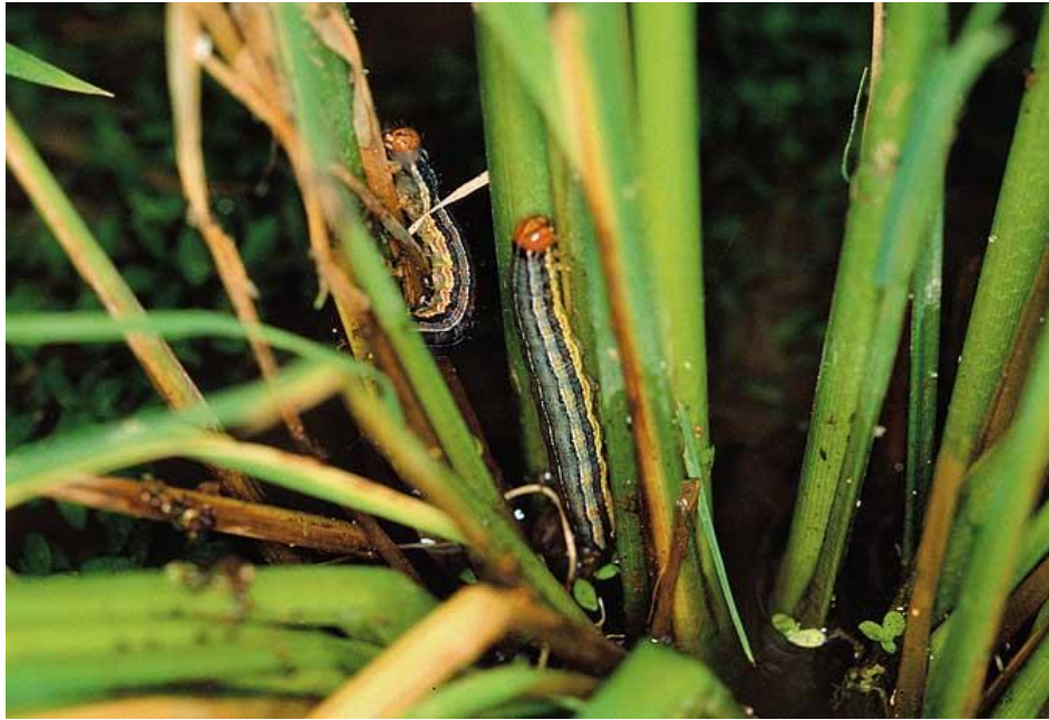
Armyworm damage at mandya