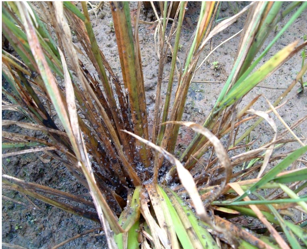
WBPH Damage at Mandya